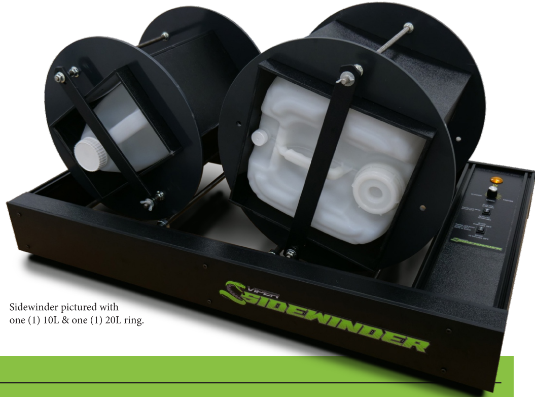
Sidewinder pictured with one (1) 10L & one (1) 20L ring.

Custom roller rings are available by request.